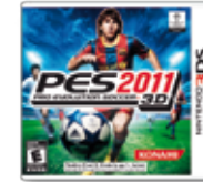
Pro Evolution Soccer 2011 3D