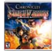
Chronicles Samurai Warriors