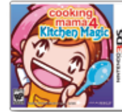
Cooking Mama 4 Kitchen Magic