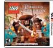
LEGO The Pirates of the Caribbean: The Video Game