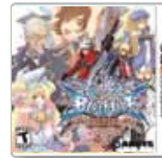
BlazeBlue Continuum Shift II