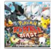
Pokémon Rumble Blast