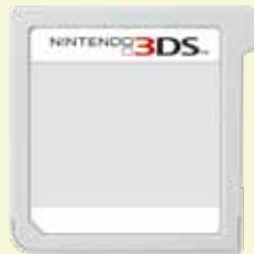
Nintendo 3DS Software *1