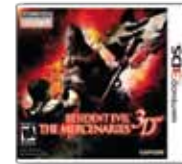
Resident Evil® The Mercenaries 3D