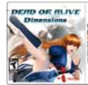
Dead or Alive Dimensions