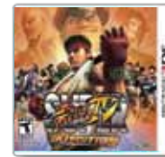
Super Street Fighter IV 3D Edition