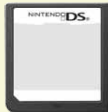
Nintendo DS / DSi Software *2 *3